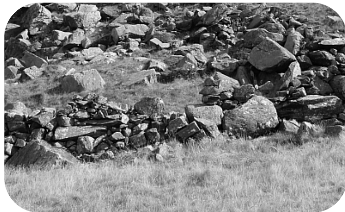
Section of single wall to be repaired