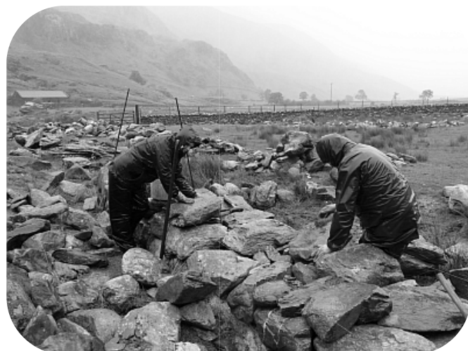
Rita and Emlyn. May Taster at Blaen y Nant. Rita travelled all the way from Aberystwyth to enjoy the scenery...

Training remains the hub of our summer activities, as usual the papers in the west are not printing anything so numbers have been a little disappointing.