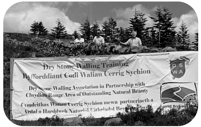
June taster day on Moel Famau

Anyway we must assume something is happening as our sponsorship from the Clwydian Range AONB continues.