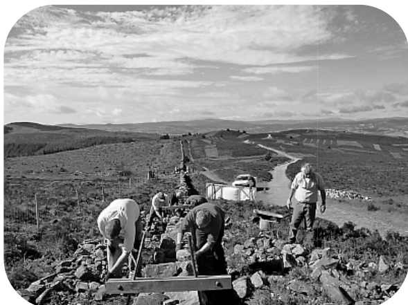
Proof positive that they do have courses in the east, and better weather too. (June)

Meanwhile in the east there has been at least one weekend course, I can tell because Colin provided details and photos of the one he instructed on... I assume there have been others but Information has proven difficult to obtain, and so press coverage might be described as muted over this way too.